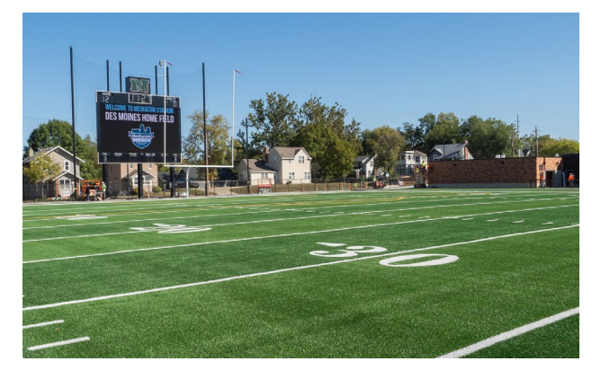
Provided $100,000 to the Des Moines Public Schools and Drake University Mediacom Stadium.

Delta Dental proudly supports projects through direct investments and charitable giving to increase healthy activities, support healthy communities, and improve the social and emotional well-being of lowans. In 2023, Delta Dental contributed $807,007 to direct investments and charitable giving.