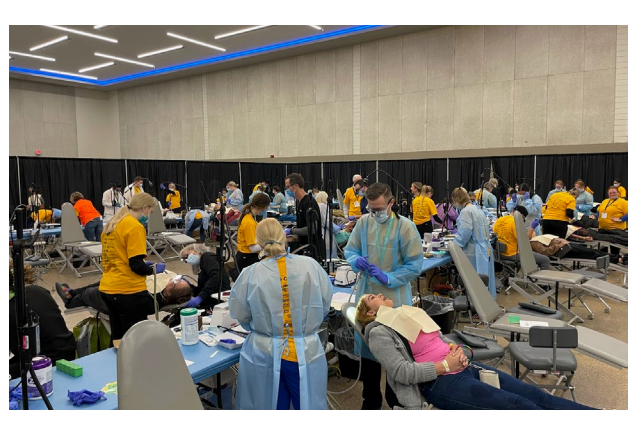
Employees volunteered at the Iowa Dental Foundation's Mission of Mercy 2023 free dental clinic.