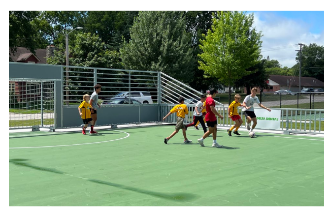
Contributed $50,000 to nonprofit Kick it Forward to bring five Mini-Pitch soccer fields to Des Moines, Webster City, Ames, Oskaloosa and Ottumwa.