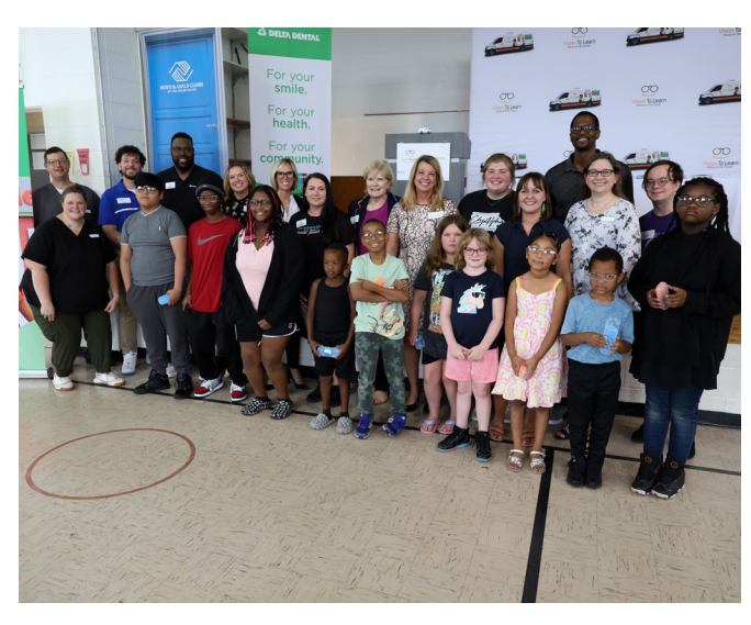
Vision To Learn Grant announcement and glasses celebration event at the Boys & Girls Clubs of the Cedar Valley.