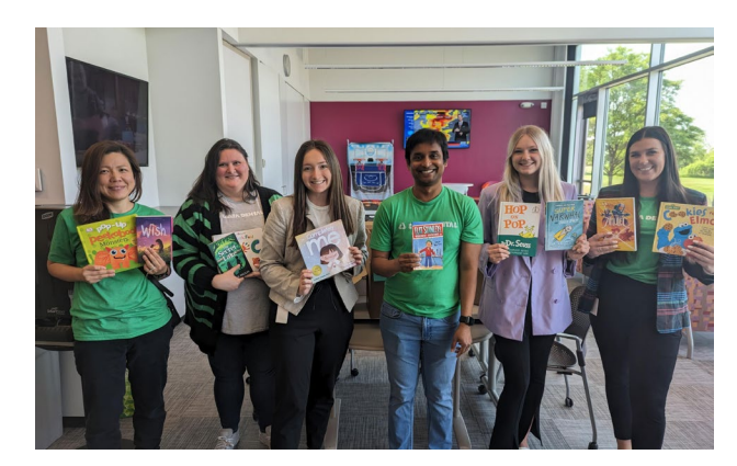
Employees gave back by assembling reading kits and donating books to United Way's Stuff the Bus .